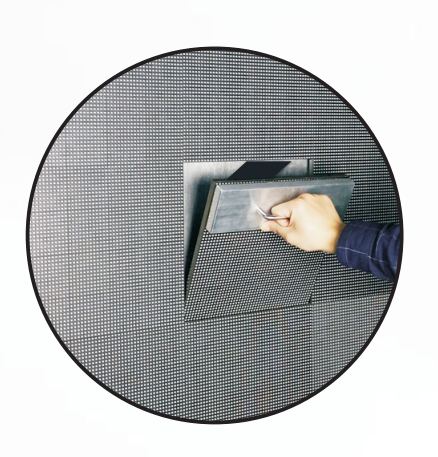
2.Remove the panel quickly by hand.