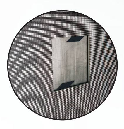
3.Remove the ribbon cable.