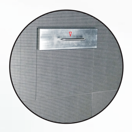
1. Apply the tool to the panel in question